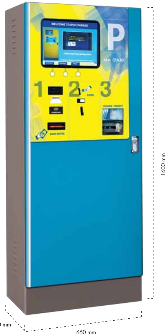
APS - 1300

All APS units are connected to the CMS Back Office Management System via a Local Area Network cable. All APS units are usually located at the lobby and car park lifts areas for easy access to the visitors.