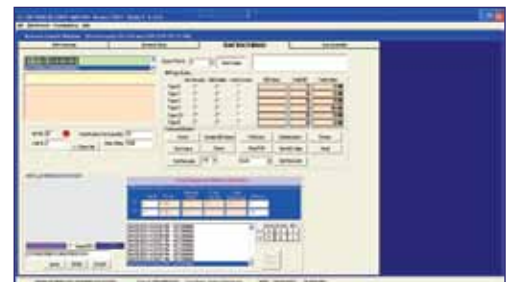
Bank Note Collection Status