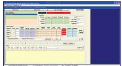
Coin Compartment Information