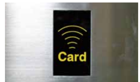
Optional with Season Payment